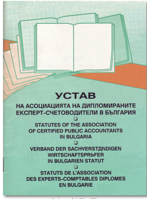
By-laws of ACPA, 1991

The By-laws of the Association were approved.