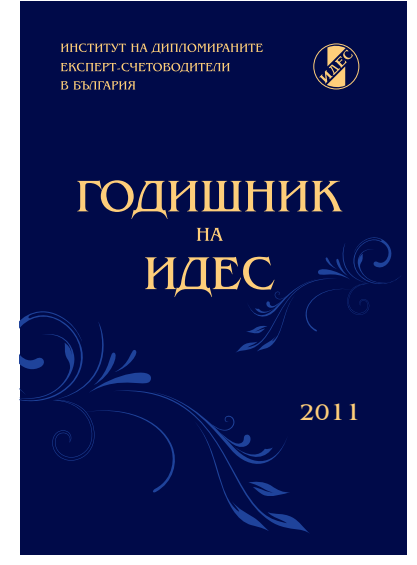
Cover of the Year Book for 2011 of ICPA