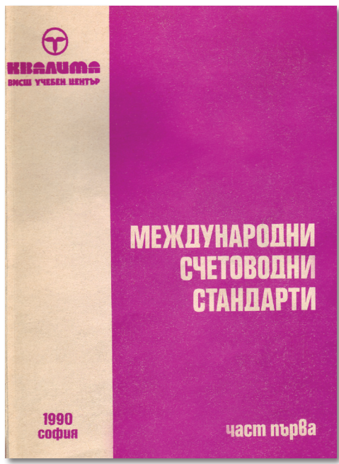
The first issue of the International Accounting Standards in Bulgarian, 1990

As early as 1990 the International Accounting Standards were translated and issued in Bulgarian.