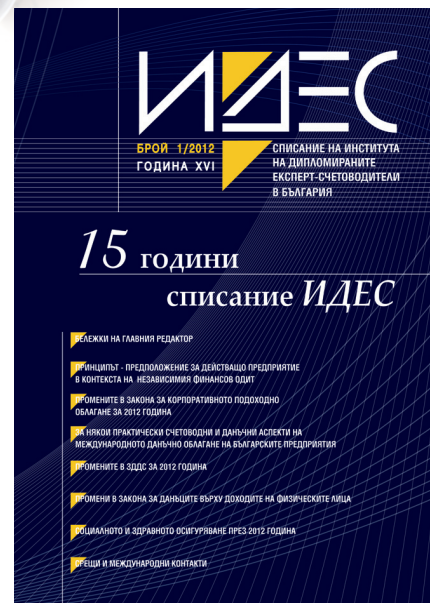
The cover of issue one for 2012 of "ICPA" magazine