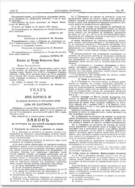
Law on The Institue of Sworn Public Accountants

were feeble. At the same time in some countries well advanced for their time, organizations and bodies of public accountants (auditors) had taken actions, which gave positive results. According to the then available data the auditor's profession had existed since the 13th century in England, in Italy since 1879, in France since 1881; in Germany since 1894; in Holland since 1895; in Austria since 1905, etc.