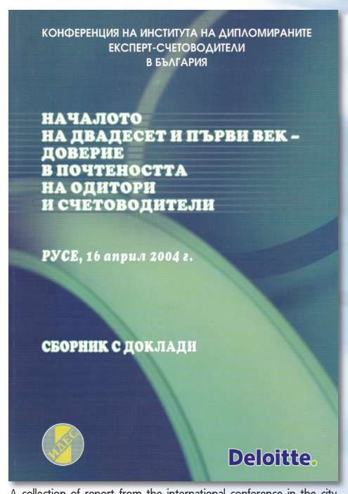
A collection of report from the international conference in the city of Rousse, 2004

The Institute of the Certified Public Accountant took part in events of foreign and international bodies and organizations.