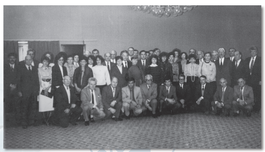
Photo of the attendees of the Incorporation Meeting held on 16 December 1991

On 16 December 1991 49 people officially authorized to practice the profession held their first get-together where they decided to establish a professional organization — "Association of the Certified Public Accountants in Bulgaria", as a self-funded voluntary union.