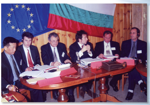
Founding of SEEPAD, 9-10 March 2000, town of Bankya

In this respect the following also took place: