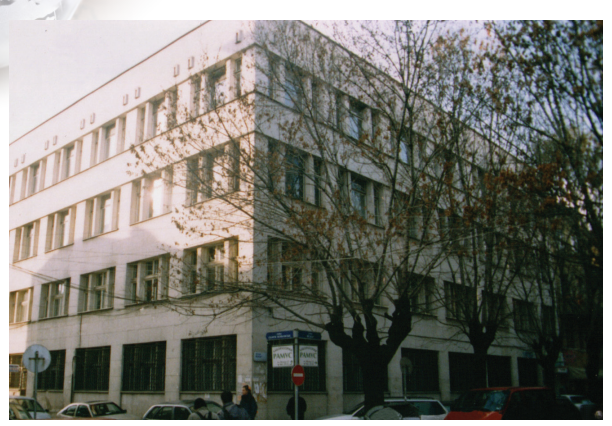
Principle office of ICPA

"The Institute of the Certified Public Accountants is a self-funded legal entity"