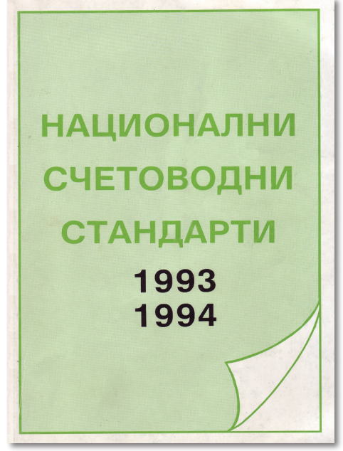
National Accounting Standards

1992 saw the approval of 18 National Accounting Standards .