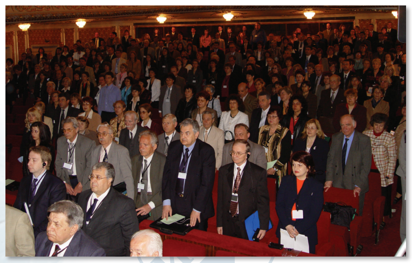
Attendess to the IV Congres of ICPA

Concluding and performance of contracts for cooperation with similar institutions