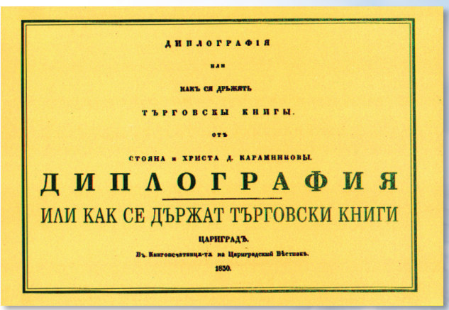
The first Bulgarian accounting book of 1850 "Diplography"